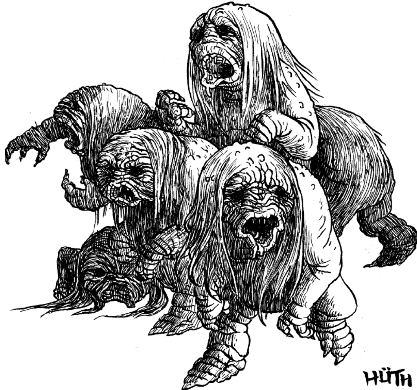
Fascist Racist Maggot People MAGAt Tribe