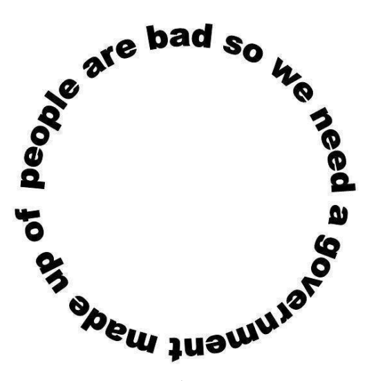
Statist circular reasoning.

"A man is no less a slave because he is allowed to choose a new master once in a term of years." - Lysander Spooner